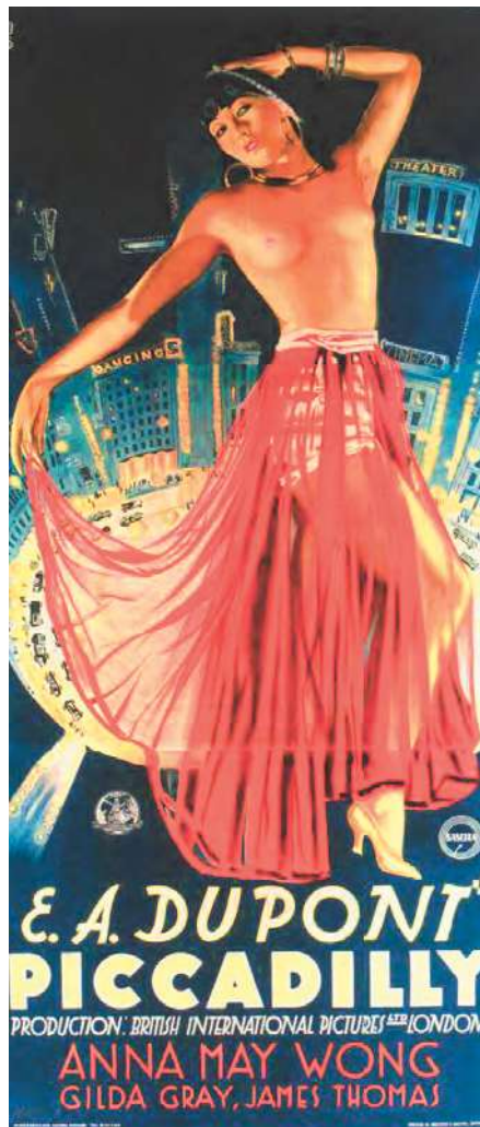
PICCADILLY Poster

“In the same vein, student filmmakers are a focus of our programming, as the great storytellers of tomorrow,” she adds, noting that education in film,