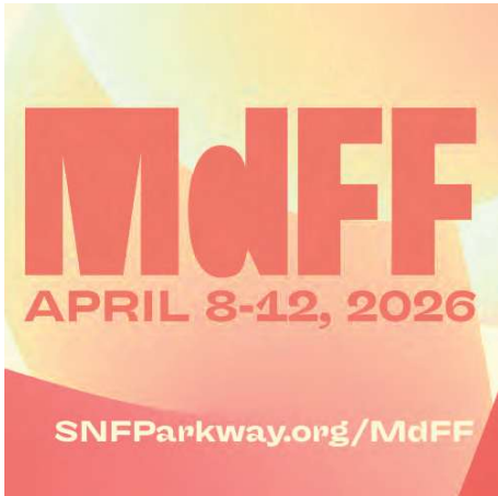
A poster for the Maryland Film Festival attracts filmmakers and film lovers from all around the world.