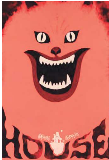
HOUSE Poster CREDIT: XXXX